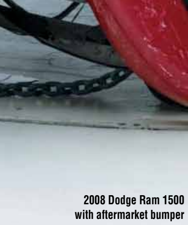
2008 Dodge Ram 1500 with aftermarket bumper

Aftermarket bumpers may look the same out of the box as ones supplied by automakers, but tests show not all perform the same as original equipment. The Institute crash tested a 2008 Dodge Ram 1500 outfitted with an aftermarket bumper that meets CAPA's requirements in a 40 mph offset frontal test, then compared it with a Ram with a Dodge bumper. Both pickups had similar crashworthiness measures and damage patterns, showing that aftermarket parts can be reverse-engineered without affecting safety. On the other hand, in 5 mph tests comparing an aftermarket bumper that doesn't meet CAPA's requirements on a Toyota Camry with a Toyota-made bumper on another Camry, there were clear differences. The center of the Toyota bumper buckled. The stronger aftermarket bumper didn't buckle, and as a result the bumper frame ends crushed. Small changes in design can skew airbag sensors and alter vehicle damage patterns.