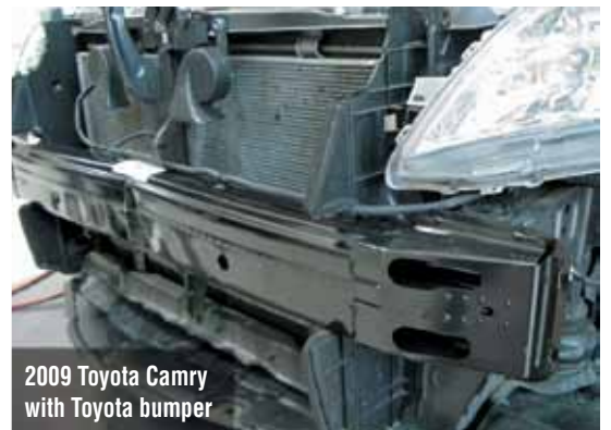
2009 Toyota Camry with Toyota bumper