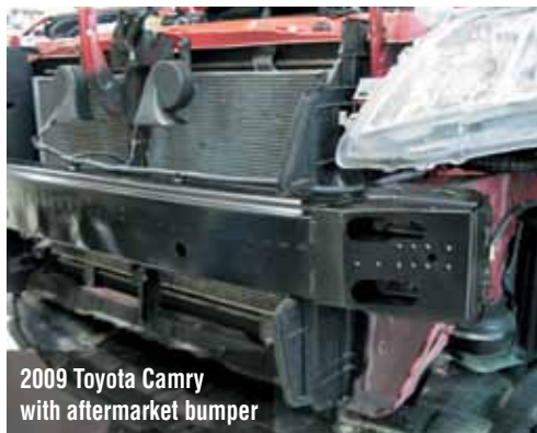
2009 Toyota Camry with aftermarket bumper