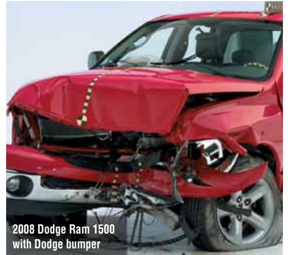
2008 Dodge Ram 1500 with Dodge bumper