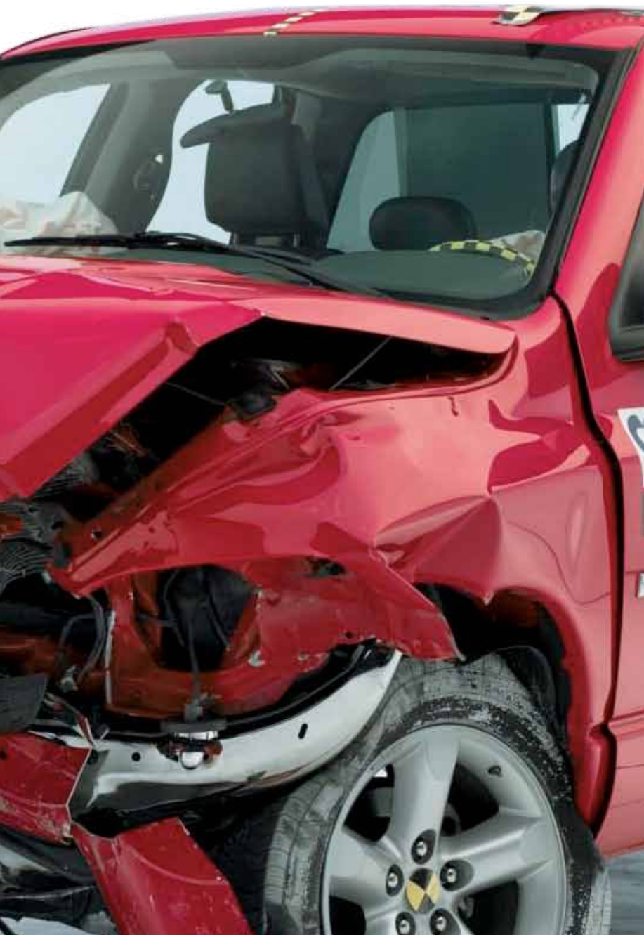
2008 Dodge Ram 1500 with aftermarket bumper