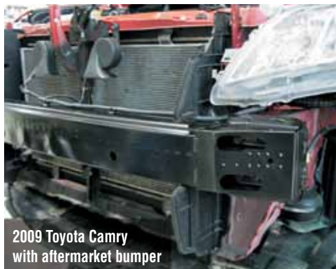
2009 Toyota Camry with aftermarket bumper

Aftermarket bumpers may look the same out of the box as ones supplied by automakers, but tests show not all perform the same as original equipment. The Institute crash tested a 2008 Dodge Ram 1500 outfitted with an aftermarket bumper that meets CAPA's requirements in a 40 mph offset frontal test, then compared it with a Ram with a Dodge bumper. Both pickups had similar crashworthiness measures and damage patterns, showing that aftermarket parts can be reverse-engineered without affecting safety. On the other hand, in 5 mph tests comparing an aftermarket bumper that doesn't meet CAPA's requirements on a Toyota Camry with a Toyota-made bumper on another Camry, there were clear differences. The center of the Toyota bumper buckled. The stronger aftermarket bumper didn't buckle, and as a result the bumper frame ends crushed. Small changes in design can skew airbag sensors and alter vehicle damage patterns.