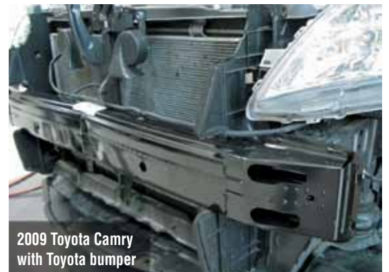
2009 Toyota Camry with Toyota bumper